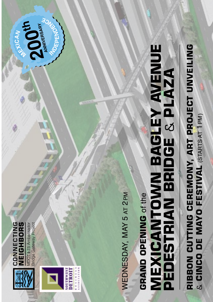
Dimensions: 6.0"w x 4.25"h